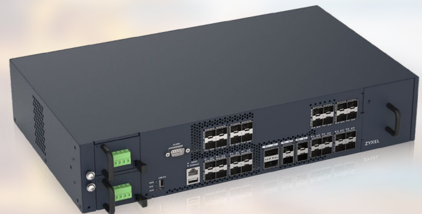
2U 32-Port All-In-One PON Whitebox OLT SDA3032SS

These All-in-One PON SDN Access OLTs simultaneously support XGS-PON, GPON, and Combo PON technologies. The carrier-grade temperature-hardened compact hardware design gives service providers deployment flexibility for diverse environments.