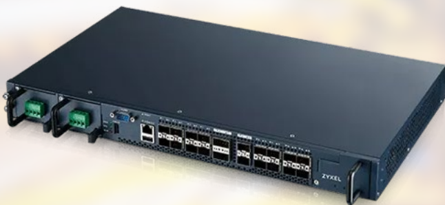
1U Pizza Box 16-port Combo PON Whitebox OLT SDA3016SS